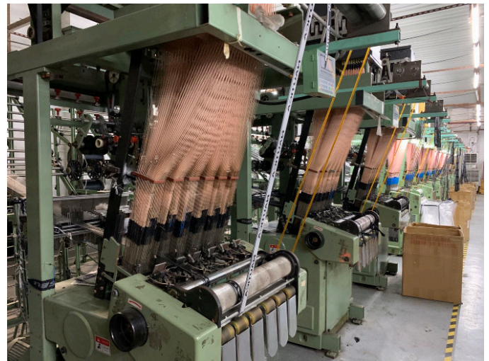
Attachment 4 (Weaving area.jpg) Tour On-Site - Question 23 , Page 13