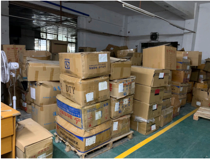
Attachment 5 (Yarn storage area.jpg) Tour On-Site - Question 23 , Page 13