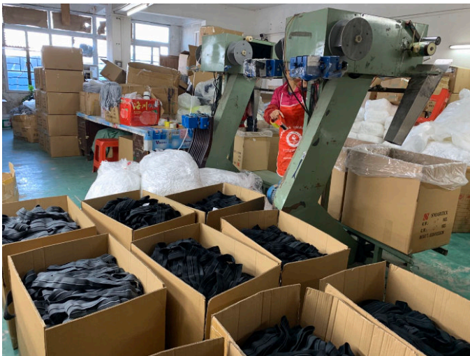
Attachment 3 (Packaging area.jpg) Tour On-Site - Question 23 , Page 13