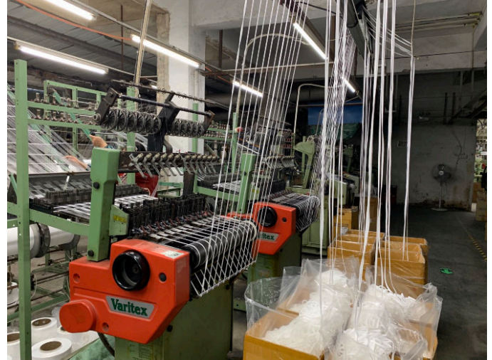
Attachment 2 (Knitting area.jpg) Tour On-Site - Question 23 , Page 13